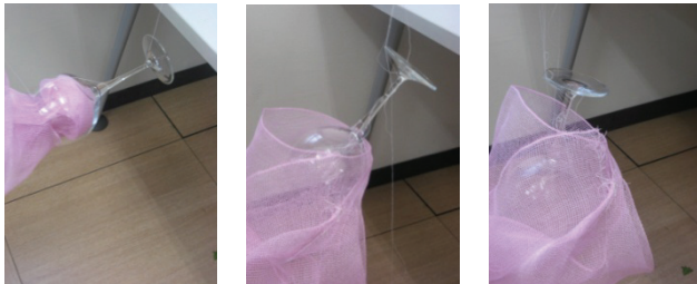
Figure 2. Animating a self-cushioning wine glass (notice the fishing line used to suspend the object between frames).

The textile workshop was designed to explore the potential of active materials. Students worked in pairs to make animations for each individual's concept. Their projects explored ambitious themes they would have been unable to otherwise prototype. Two participants prototyped fabrics that could change material properties, one at a simulated molecular level and another on the body (See Fig. 1). One student wanted to explore applications for color-changing materials; as soon as she began to animate she realized that the critical design task was to conceive of an intuitive interaction to prompt color change – she settled on a series of gestures. Another student sought to design objects that could protect themselves from impact; she soon realized that the problem was to find a material that could expand to act as a sort of airbag (See Fig. 2). In three hours, each student shot between 2 and 5 versions of their animations, dedicating only the last half hour to compositing and editing. This workshop revealed the potential of stop-motion prototyping to break down expert-novice boundaries and to rapidly confront designers with fundamental design considerations.