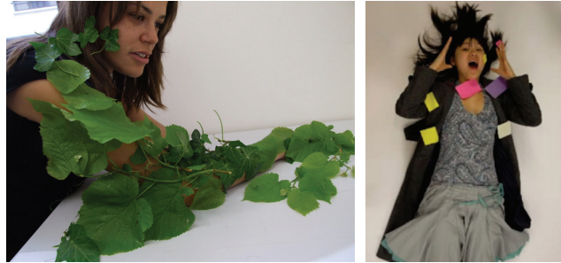
Figure 3. Using pixillation – animation of the body – to express a fantastic idea (left) or an emotion (right)

members narrated. In one case, the animation was so hard to make that the project had to be re-conceived. This workshop revealed that stop-motion animations are more useful at the early stages of conceptual development.